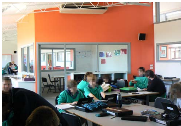
Figure 6. Learning in the SIPod

The 5/6 students are working in a redeveloped section of the older building (see Figures 5 and 6) where they have a range of options in a flexible space for structuring teaching and learning. This space is known as the Senior Inquiry Pod (SIPod) and it contains withdrawal and teacher office spaces along with formal and informal spaces and furniture. This was the first of the flexible spaces in the school to be developed and has been a site of trial and experiment which has informed practices across the school. An important factor in the transition to this space is that the teaching team practiced team teaching approaches in traditional spaces for the two years leading up to this $500,000 redevelopment's completion, giving an indication of the thorough planning and thought process that has gone into creating the space. The space includes withdrawal rooms, teacher offices,