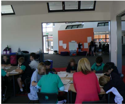
Figure 3. Middle Inquiry Pod (MIPod)