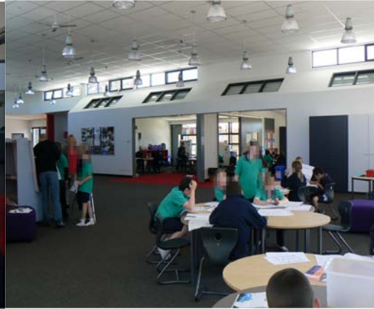
Figure 4. Open gallery space in the MIPod

As yet, the Prep teachers team plan but do not team teach which is a function of the traditional spaces that they inhabit. The future development of this space in line with the rest of the school will allow for 'a smarter use of time', better distribution of physical and human resources and also an opportunity that will help to shape better learning outcomes through more personalised approaches and coordinated efforts. The teachers are also hoping to develop outdoor learning spaces that allow for a natural flow in and between learning spaces and activities.