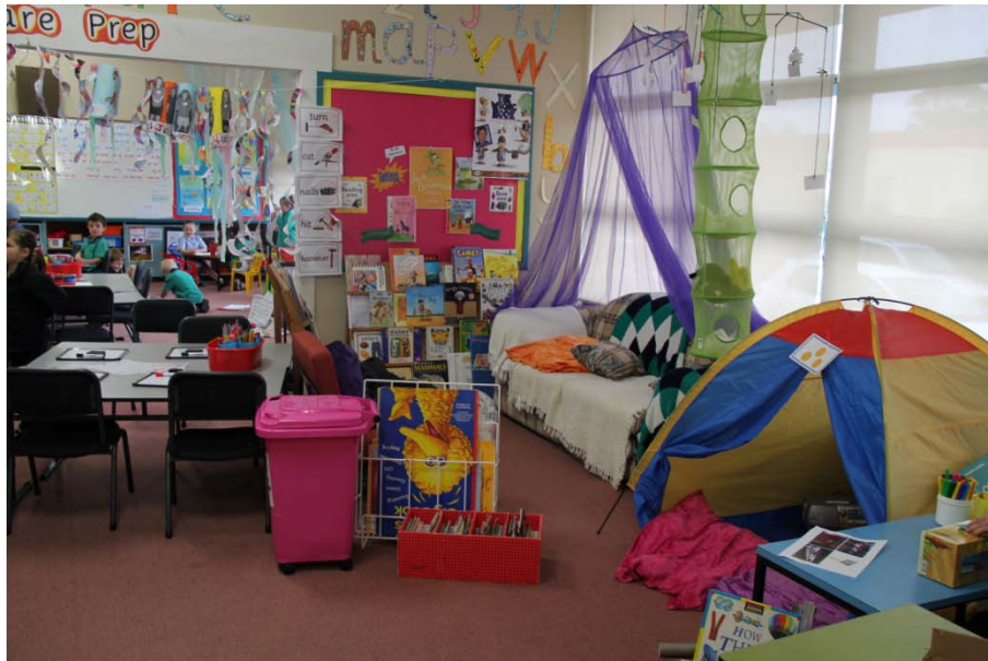
Figure 7. Prep Developmental Classroom

The program is not purely developmental in its structure but includes explicit skills teaching as well. There is the inclusion of a synthetic phonics program (THRASS) which is systematic and structured to help cater for the broad range of entry points he sees in the students.