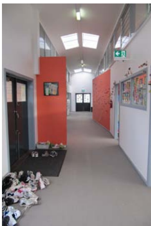
Figure 5. SIPod Corridor

The 1/2 team is team teaching and planning. They have three classes and four teachers. The extra teacher is utilised in different ways for different needs – sometimes taking an explicit small teaching group and other times as a roving teacher during independent inquiry sessions. However, they are teaching in relatively traditional spaces that are part of future development plans.