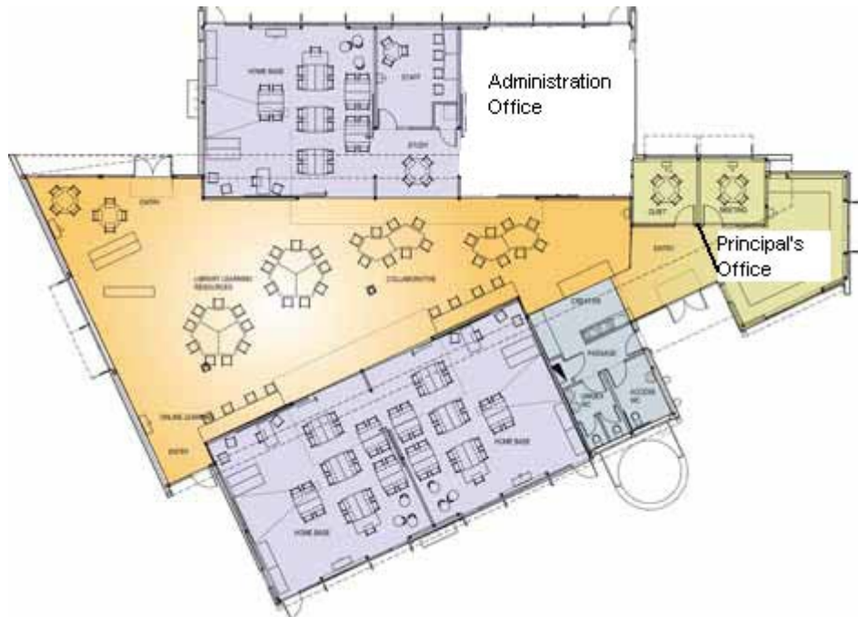
Figure 2. BER Library and Classroom Plan

However, on the back of the innovative approach to cultural change Grovedale West Primary School has been successful in securing a $2 million BER building in 2010 (see Figure 2).