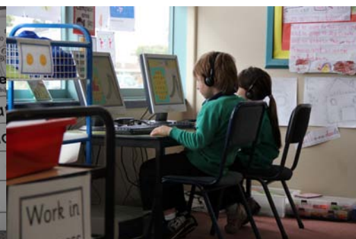
Figure 9. Independent Learning in Prep